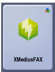
Fax Server Selection Button