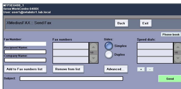
Fax Addressing Screen